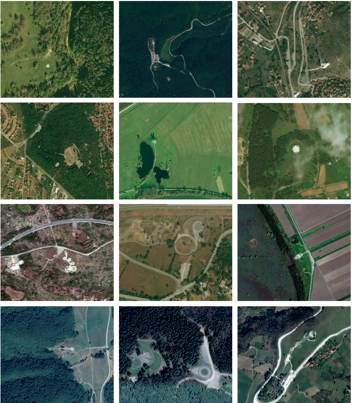
Figure 5: Memorial Area Aerial Views

1: Central Monument in Biješe Potoci, Croatia | Monument to the uprising of the people of Kordun and Banija in Vojnić, Croatia | Memorial Ossuary in Veles, Macedonia | 2: Memorial Park Bujanj in Niš, Serbia | Jasenovac Memorial and Museum in Jasenovac, Croatia | Makedonium in Kruševo, Macedonia | 3: Monument to the Fallen Soldiers of Lješanska nahija in Barutana, Montenegro | Monument to the Victims of Fascism in Podhum, Croatia | Stratište Memorial Complex in Jabuka, Serbia | 4: Monument to the Battle of Sutjeska and Memorial House in Sutjeska National Park, Bosnia-Herzegovina | Monument to the Revolution in Kozara National Park, Bosnia-Herzegovina | Memorial Complex Kadinjača in Uzice, Serbia