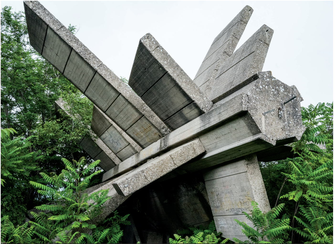
Figure 4: Monument to the Liberators of Knin, Knin Croatia

Documentation can last from one to four hours depending on the type of site — these sites exist as large-scale memorial areas complete with interpretive programming in the form of memorial houses, museums, plaques or as stand-alone roadside monuments (see figure 5 for aerial views of a variety of site types) and . Upon arrival, I begin photographing the procession to the monument from the point of entry and back out.