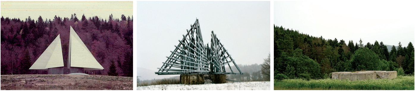
Figure 3: Central Monument, Kamensko Memorial Area - Archive of Nenad Gattin, early 1980s | Spomenik #13 (Korenica) - Jan Kampaners 2007 | Central Monument Kamensko Memorial Area - Author 2016

and stated that he had had a guide who spoke with the locals, so he wasn't able to help locate it remotely.